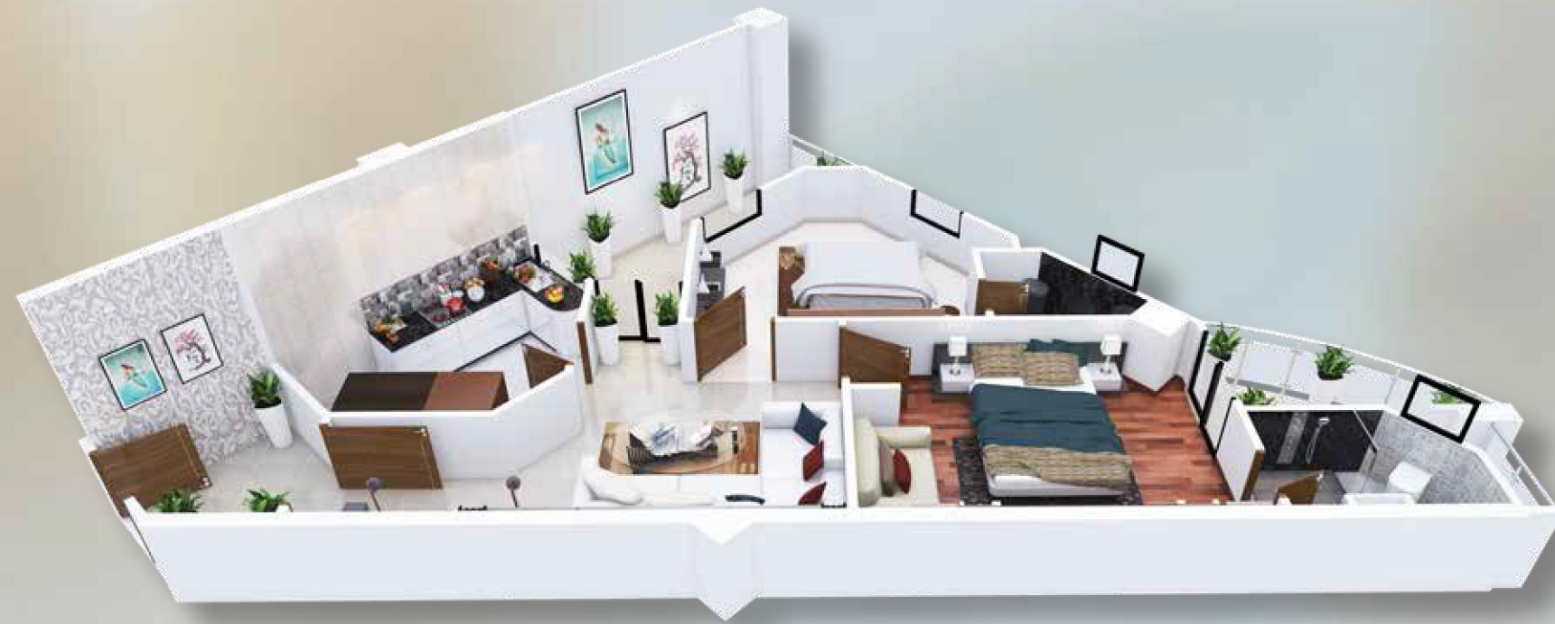
TOWER-03 TWO BEDROOM APARTMENT