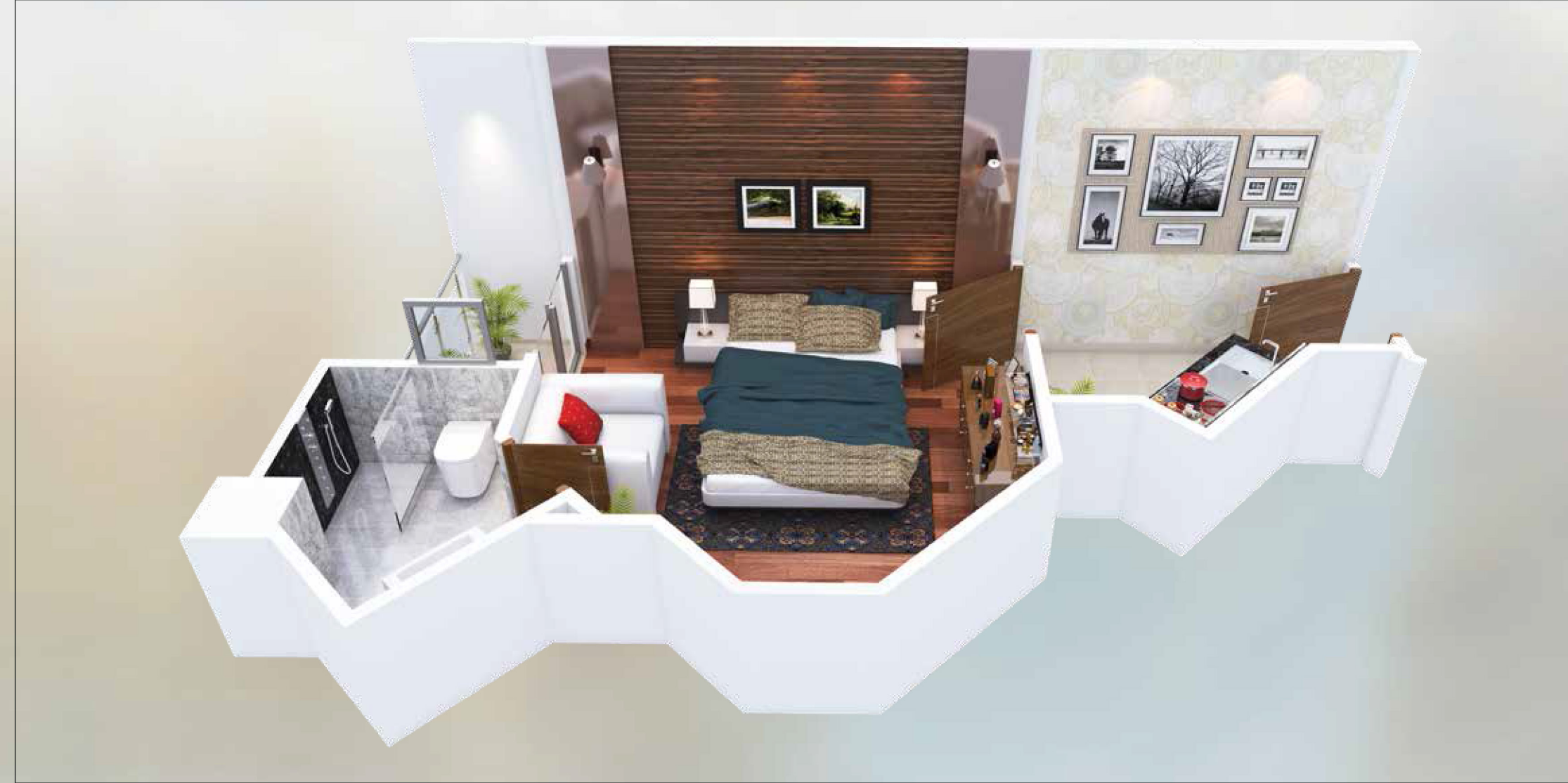
TOWER-01 ONE BEDROOM APARTMENT