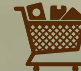
Suma Super Market