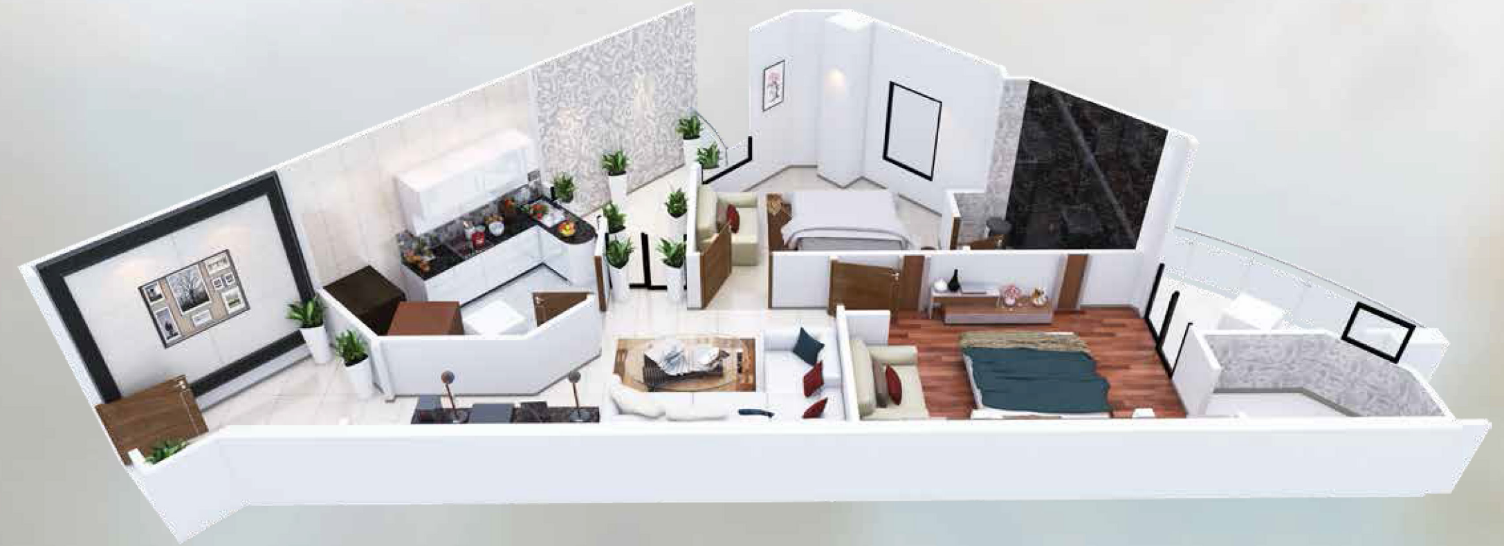
TOWER-02 TWO BEDROOM APARTMENT