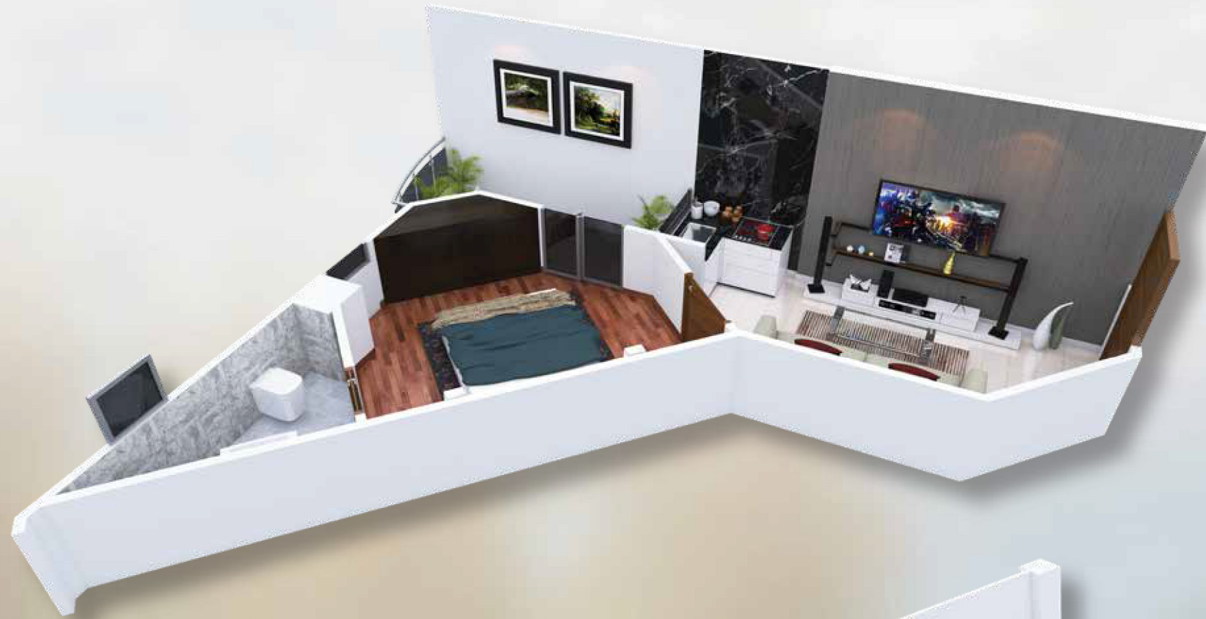
TOWER-03 ONE BEDROOM APARTMENT