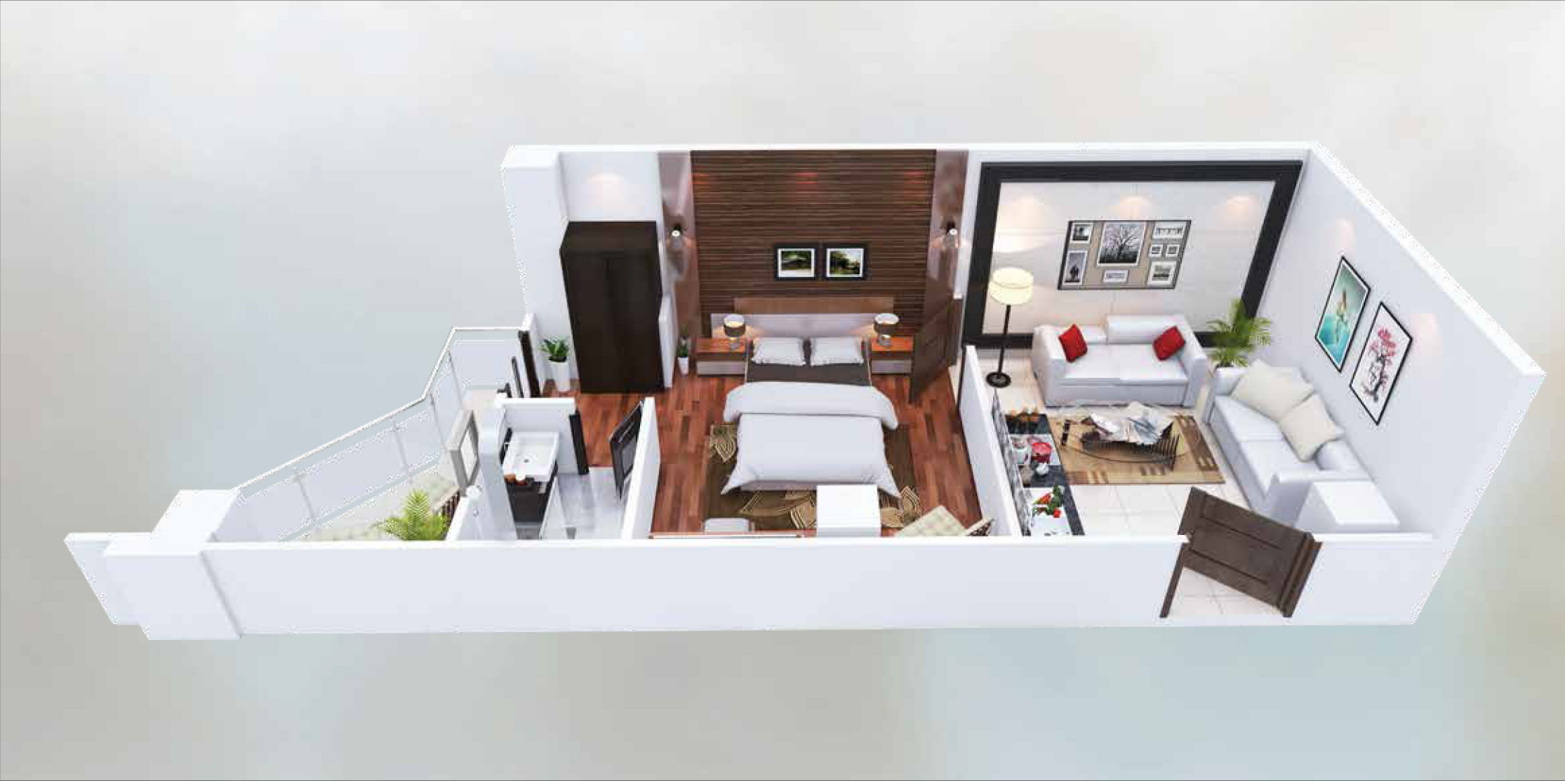
TOWER-01 ONE BEDROOM APARTMENT