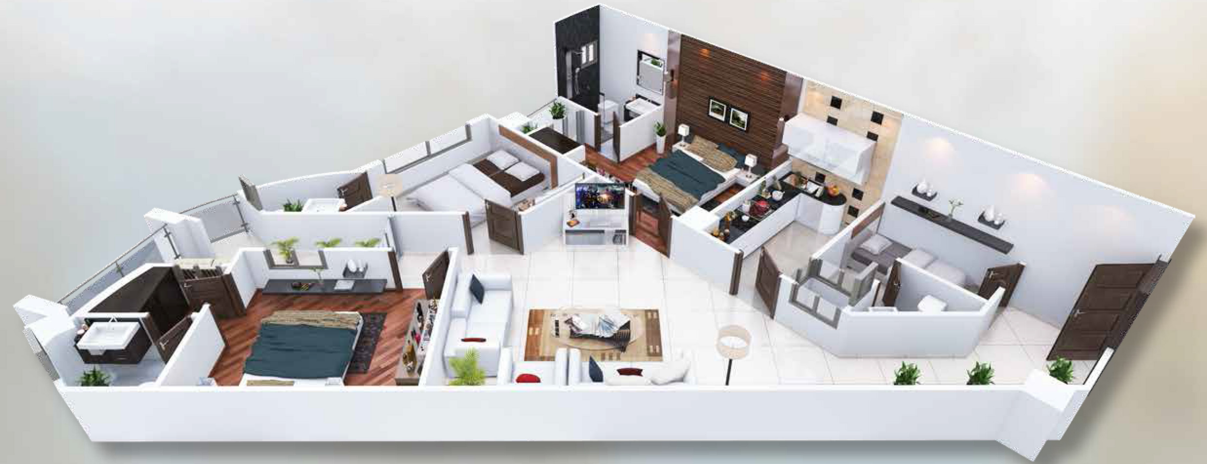
TOWER-03 THREE BEDROOM APARTMENT